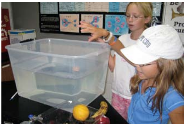
Students explore items that sink or float.

that were sparked by their explorations. The following questions are examples of what students have pursued: